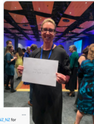
Tech & Science Council of CSANZ